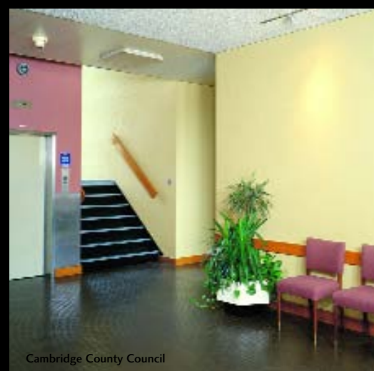
Cambridge County Council

SAMPLES ARE FOR GUIDANCE ONLY. THE SURFACE FINISH AND TEXTURE IS LARGELY DETERMINED BY THE HAND OF THE INDIVIDUAL APPLICATOR. FINISH TEXTURE SHOULD BE AGREED ONLY AFTER SITE MOCK-UP HAS BEEN CARRIED OUT BY THE CHOSEN APPLICATOR.